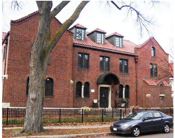
Family Treatment Center